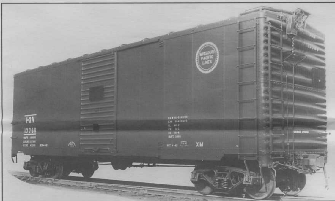
I-GN No. 17766, new 4-42, ACF Photo, Courtesy Ed Hawkins

In the early 1940s, the Missouri Pacific began re-equipping its freight car roster with all-steel 10'6" IH AAR 1942 design boxcars. In April-May 1942, ACF delivered a unique block of cars with Youngstown doors with Union Duplex door rollers, hardware and door stops and a solid side sill from bolster to bolster. The 5/5 "W" section ends differed from common practice in several small respects.